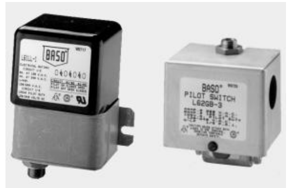
Figure 1: L61 and L62 Safety Shutoff Devices

In Non-100% shutoff models L61LL and L62AA applications, if the pilot flame is extinguished, the switch will interrupt gas flow to the main burner only , shutting down the appliance. Pilot gas will continue to flow until the pilot gas is manually shut off.